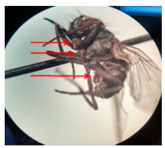
Figure 3. Anatomical location of Macrocheles muscaedomesticae in Stomoxys calcitrans (Olympus SZ-61).