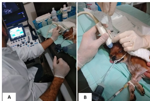
Figure 2. Collection of cerebrospinal fluid through bregmatic fontanelle in a dog with hydrocephalus and meningoencephalitis. (A) Ultrasound to determinate the best region to collection. (B) collection the material by spinal needle puncture.

The liquid was colorless, with a clear appearance, density of 1006, pH 8.0, proteins 110.0 mg/dL, glucose 6.7 mg/dL and with the presence of occult blood. Cytology demonstrated the presence of mononucleated cells (8.8 cells/mm 3 ) and a slight amount of red blood cells, indicating the presence of meningoencephalitis.